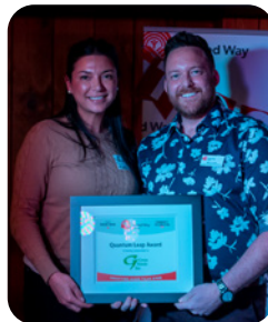
QUANTUM LEAP Green Metals