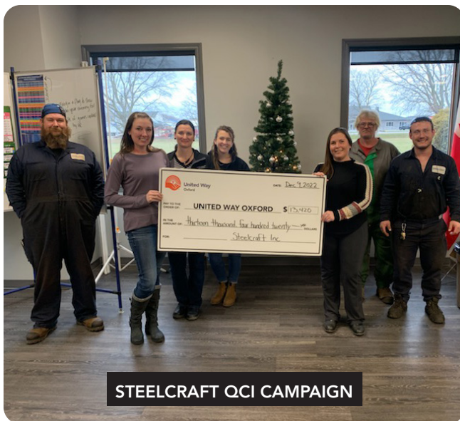
STEELCRAFT QCI CAMPAIGN