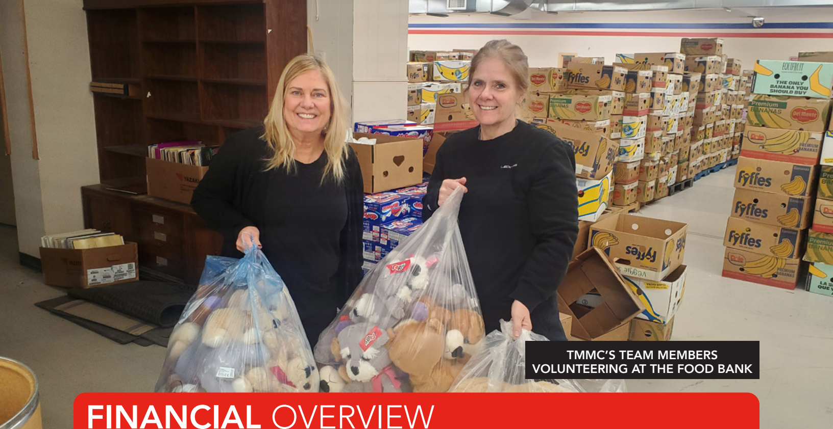
TMMC'S TEAM MEMBERS VOLUNTEERING AT THE FOOD BANK