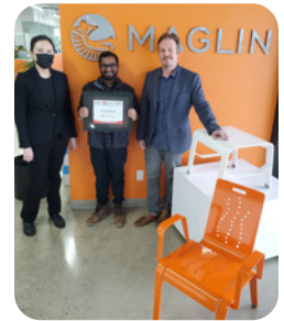
LOCAL LOVE Maglin Site Furniture