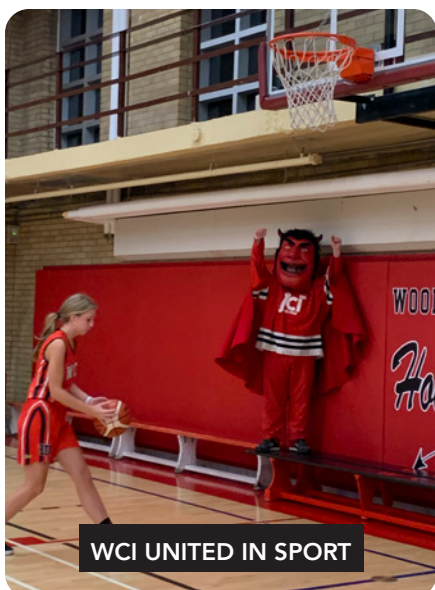
WCI UNITED IN SPORT