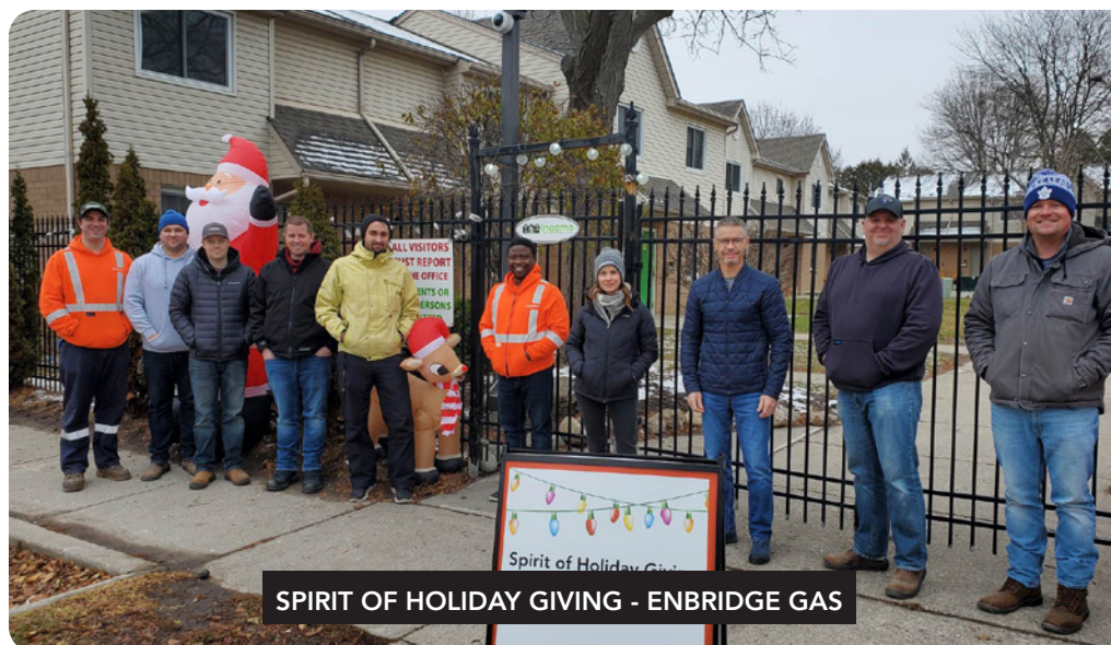
SPIRIT OF HOLIDAY GIVING - ENBRIDGE GAS