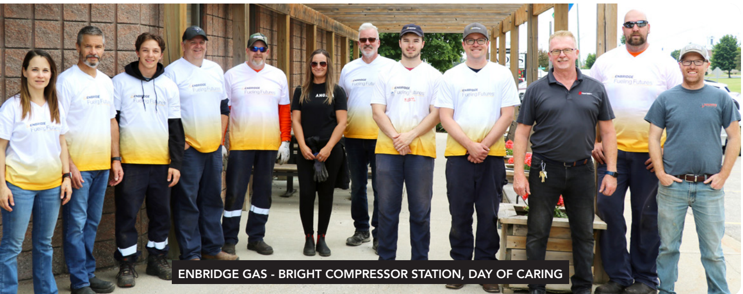
ENBRIDGE GAS - BRIGHT COMPRESSOR STATION, DAY OF CARING