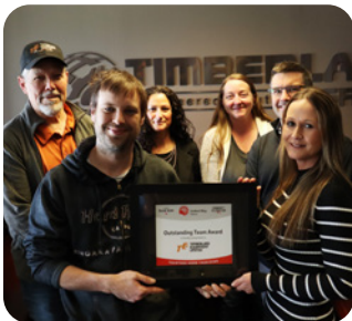
OUTSTANDING TEAM Timberland Equipment