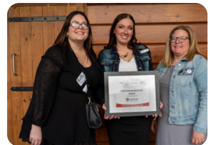
OVERCOMING ADVERSITY Unifor Local 88