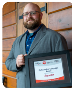
OUTSTANDING CAMPAIGN Saputo