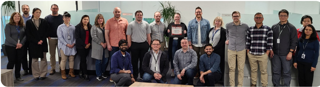
CORPORATE SUPPORT AND ENGAGEMENT Toyota Tshusho