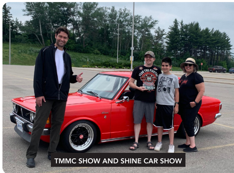
TMMC SHOW AND SHINE CAR SHOW