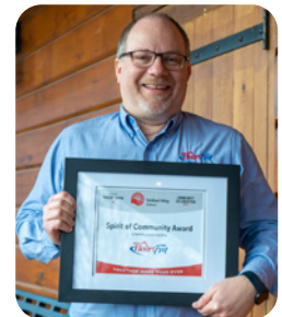
SPIRIT OF COMMUNITY 104.7 Heart FM