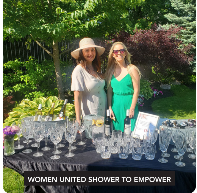
WOMEN UNITED SHOWER TO EMPOWER