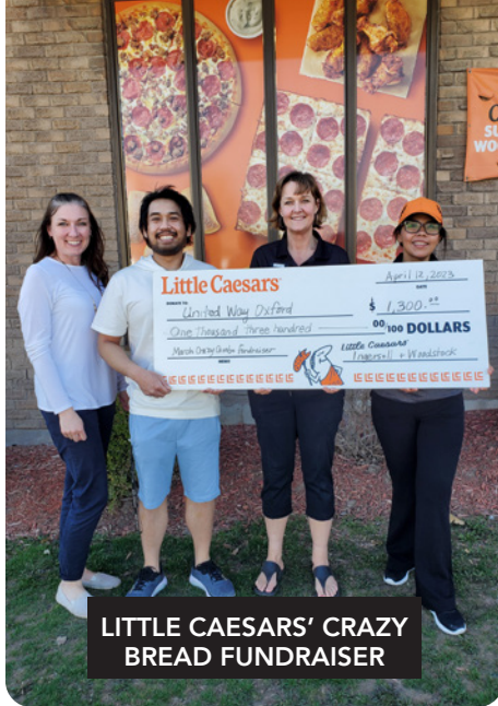
LITTLE CAESARS' CRAZY BREAD FUNDRAISER