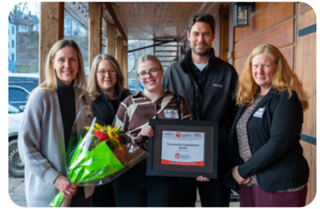
COMMUNITY COMMITMENT Toyota Motor Manufacturing Canada

Every year, United Way Oxford hosts a Community Celebration to share the amazing accomplishments of individuals, organizations, businesses, labour groups, volunteers and community partners across the County that contributed to the success of the Campaign. At the event, the Annual Spirit Award Recipients are announced and we celebrate the collective impact and difference we are making together. Thank you to this year's award recipients for their hard work, generosity, and commitment to showing their Local Love.