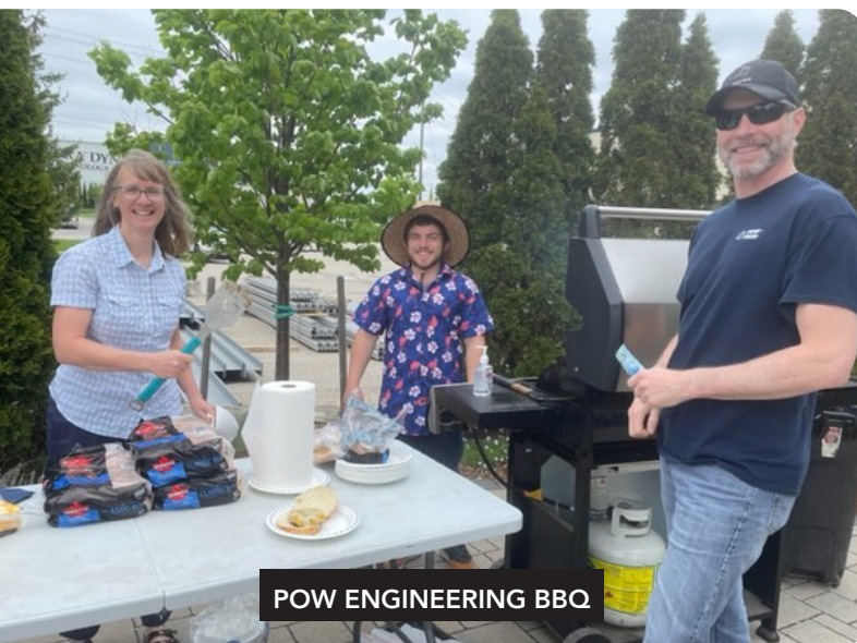
POW ENGINEERING BBQ